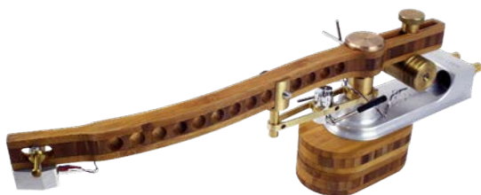
9" TA-2 Tonearm #10726

The P-series TA-1 Tone Arm features the same, handmade bamboo design as our table. It is available together or separately and can also replace the arm of most other tables. The 9" version mounts on both P-series and B-series Turntables. The 12" version only mounts on the B-series Turntable.